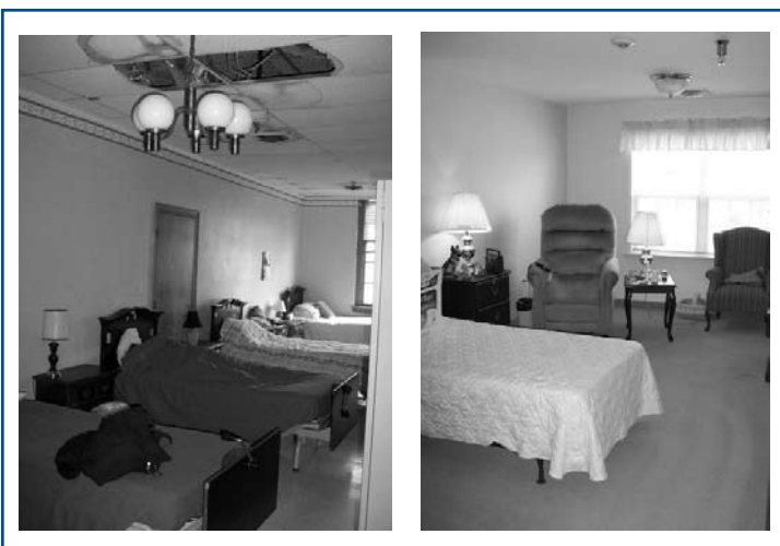
A four-person room and private bedroom at two facilities illustrate the range of accommodations in Virginia's assisted living facilities.