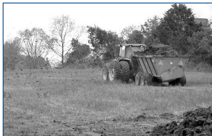
Biosolids are applied to a field in Spotsylvania County.